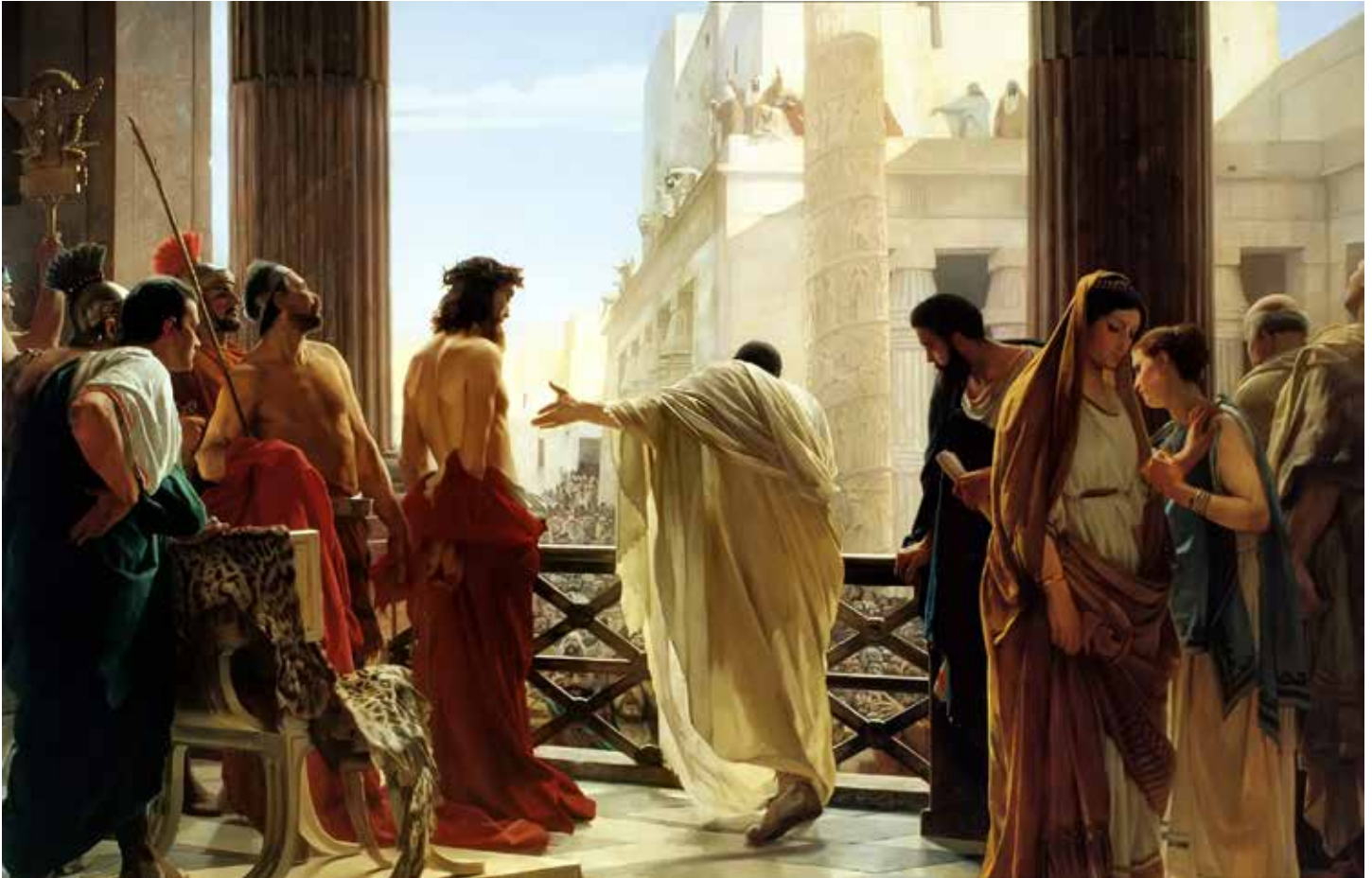
Antonio Ciseri, Ecce Homo (1871)